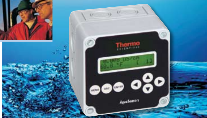
AV38 Display Module Shown with NEMA 4X Enclosure.