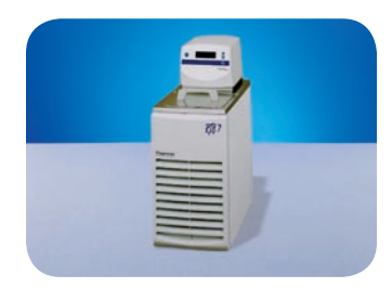
1817LL Sample Cooler